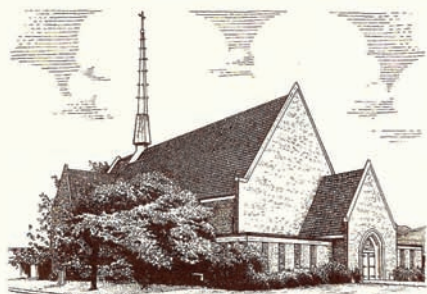
The Lutheran Church of the Redeemer