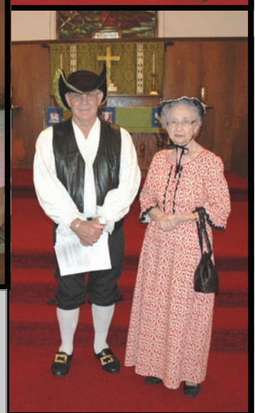
"Passages of Time" Celebrating the 250th Anniversary of St. Paul Lutheran Church October 23, 2011